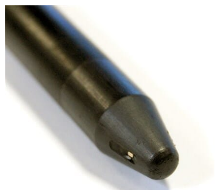
FieldScout pH Meter BluntTip ISFET Probe - Item 2127